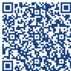
Barton Regatta Website